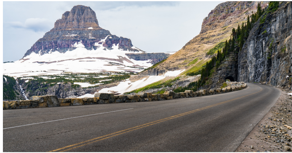
GOING TO THE SUN ROAD