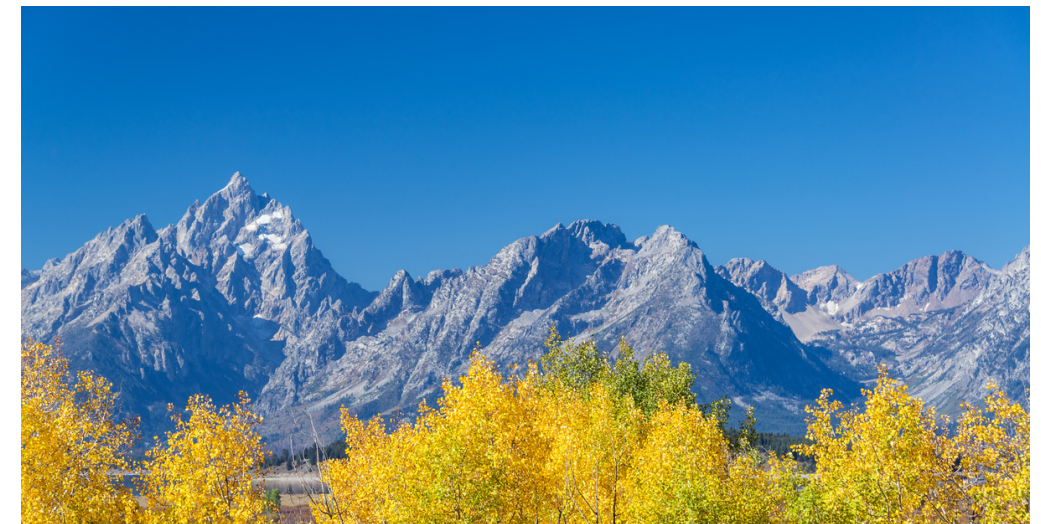
JACKSON HOLE MOUNTAINS